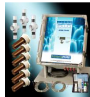
CS-450 / 450,000 gals