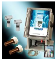
CS-150 / 150,000 gals