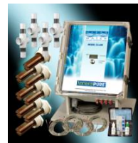
CS-600 / 600,000 gals