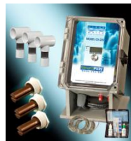
CS-225 / 225,000 gals