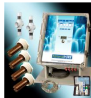
CS-300 / 300,000 gals