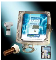
CS-75 / 75,000 gals