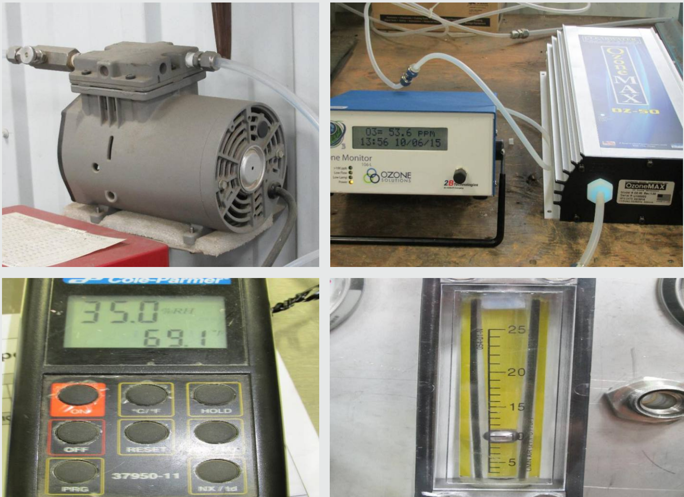
Fig.2- gaseous ozone test.

The data can be plotted to generate desired performance chart.